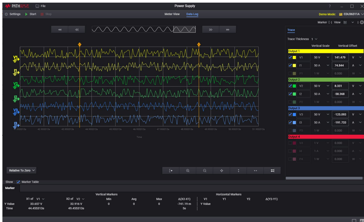
Figure 3. Data-logging with PathWave BenchVue software for the PC