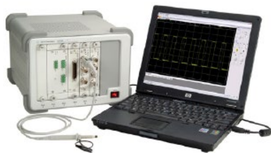
Figure 2. U2701/2A used as a modular instrument