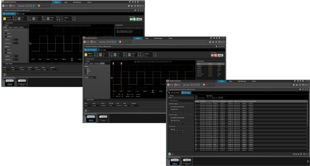
Figure 4. Controlling your oscilloscope is as easy as point and click. You can also flexibly view your signals in both waveform and data logger views.