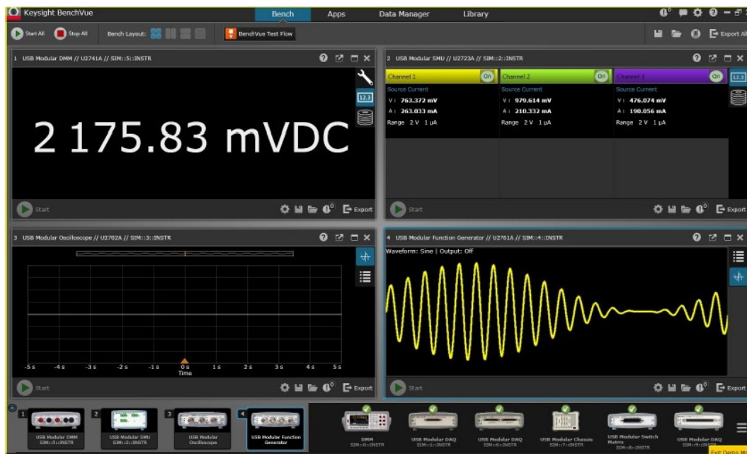
Figure 3. View measurements across USB DAQ, modular and bench instruments all on one BenchVue interface.

The USB Modular Oscilloscope App within BenchVue allows you to quickly configure and control the U2701A/2A Oscilloscope to capture and annotate screen images, record trace data and log measurements. This capability provides you with the insight you need to solve your measurement challenges and detect glitches or bugs in signals. In just a few clicks, you can also record measurements and export results to popular PC-friendly applications such as Microsoft Excel and Microsoft Word for further analysis. Additionally, you can also export data to HDF5.