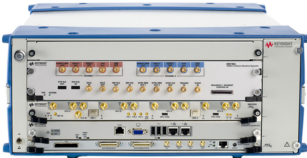
Figure 3. M8190A arbitrary waveform generator, M9703A digitizer in a M9505A 5-slot AXle chassis.

Get started: www.keysight.com/find/7modulartips