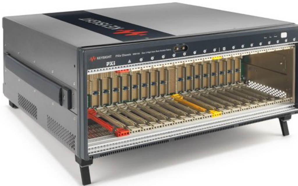
Figure 2. Keysight's M9019A PXIe 18-slot chassis, Gen 3